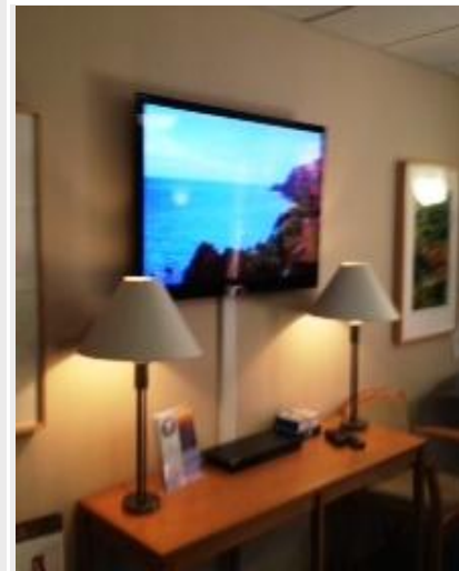
3D monitor and Blu-ray player at the Palo Alto Medical Foundation.

Our first makeover was completed at the Palo Alto Medical Foundation in May. A 3D monitor, Blu-ray disc player, and a commercial beverage machine were installed in the waiting room along with speakers in radiation treatment room.